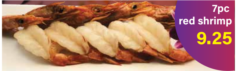
7pc red shrimp 9.25