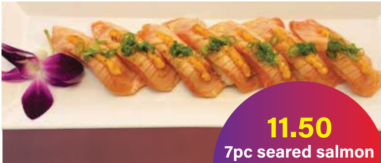
11.50 7pc seared salmon