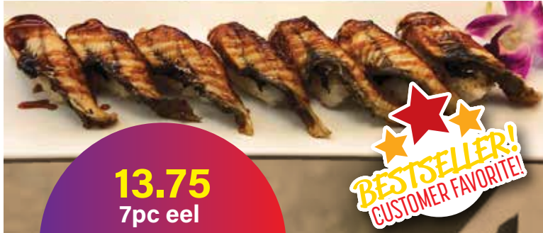
13.75 7pc eel