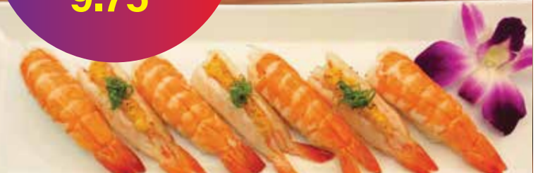
7pc special shrimp 9.75