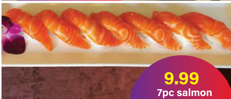
9.99 7pc salmon