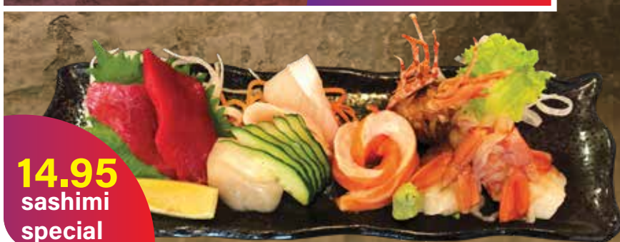
14.95 sashimi special