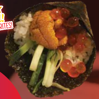
6.25 uni-ikura handroll