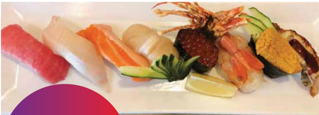
16.75 8pc premium nigiri

*Food presentation may vary depending on available ingredients.